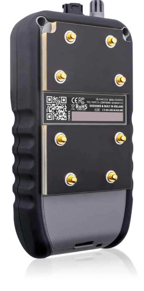
Product Order Code: CMEX5